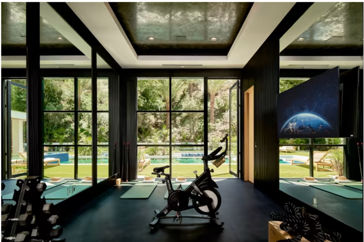
Nils Timm of Nils Timm Visuals

Upstairs, the primary wing spans a sizable 3,000 square feet and has a lounge, a two-sided fireplace, a European stone-clad bathroom, plus dual closet changing rooms, one of which features a walk-out balcony with a fire pit overlooking the grounds below.