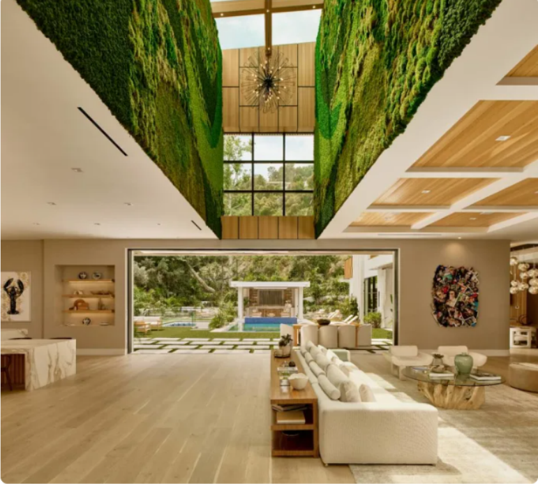
Elevated moss walls. Nils Timm of Nils Timm Visuals