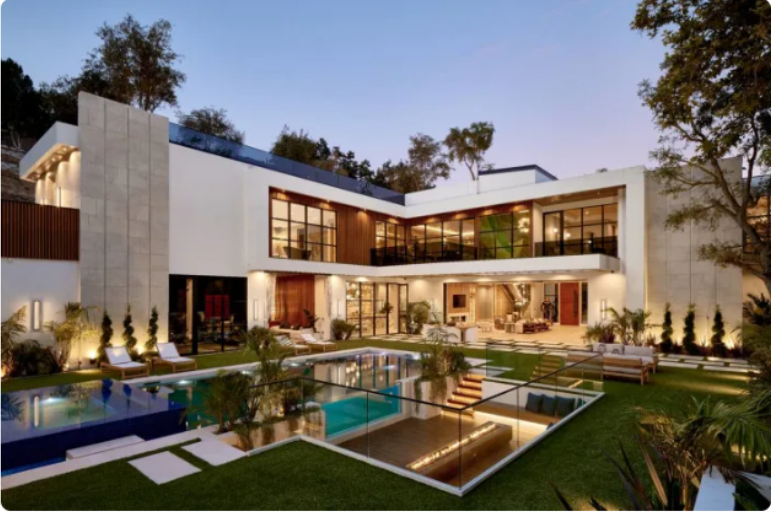
The main home spans 14,000 square feet.