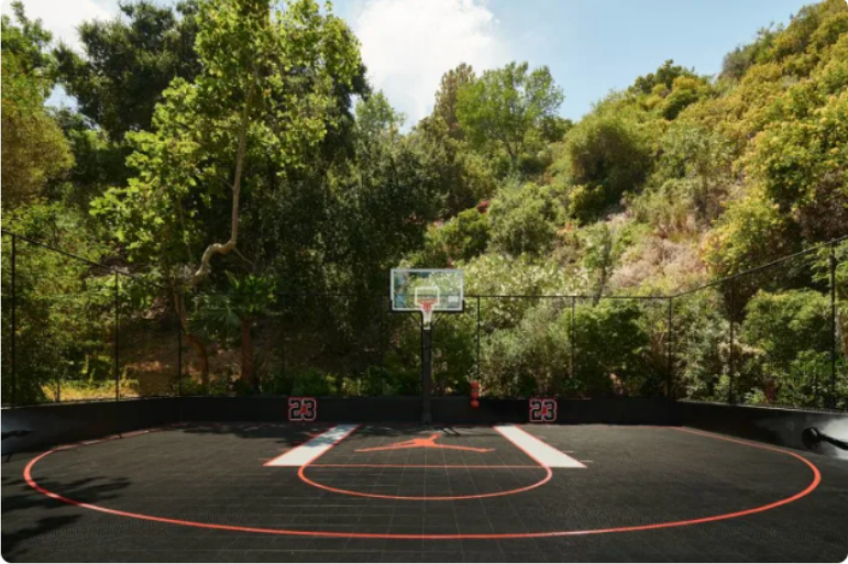
The sports complex. Nils Timm of Nils Timm Visuals