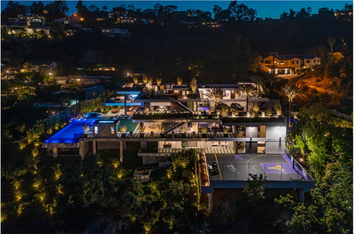
The home has three decks, a rooftop garden, an indoor/outdoor pool and a half basketball court.