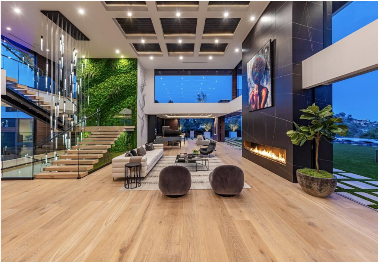
The massive home features ample indoor and outdoor living space, which seamlessly connect.