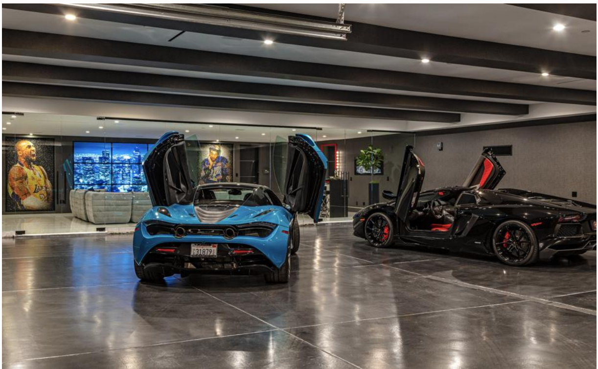
There is a 10-car auto gallery.

The amenities are nothing short of insane. There are several sports-related features, perfect for the buyer Feinberg who is a longtime basketball fan, including a half basketball court; a TV wall with room for nine screens; gym; three-hole putting green; a sports-simulator room; and indoor and outdoor pools.