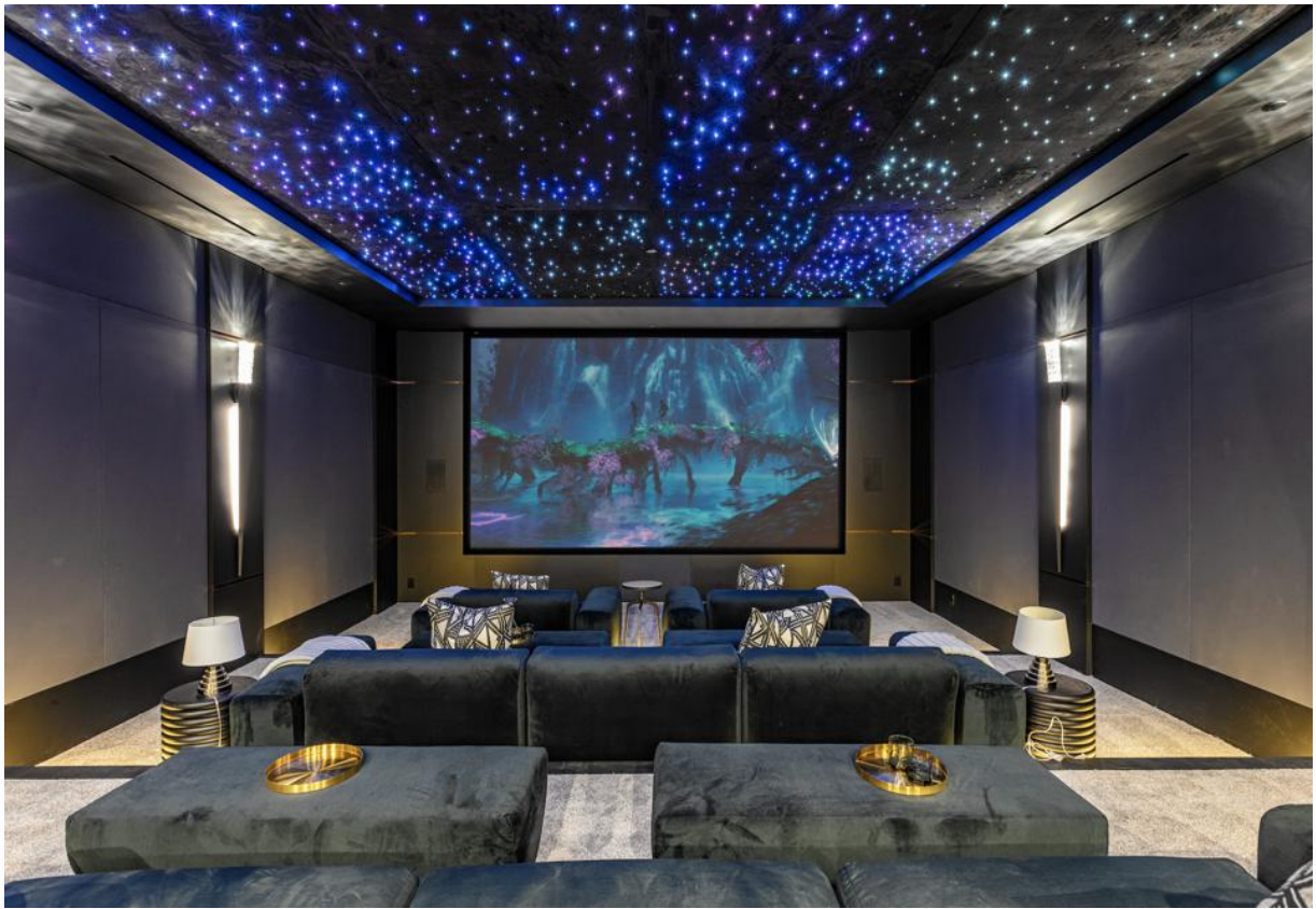
The movie theater was inspired by the interior of a Rolls-Royce, complete with a starlight ceiling.