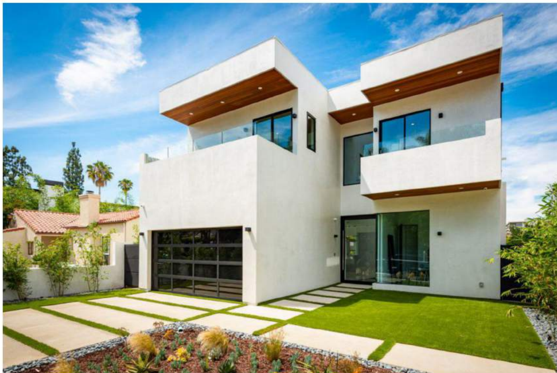
Greenleaf Cannabis House is listed for $3.5 million.

Cannabis is poised to shake the real estate industry to its foundation. Virtually mainstream, it has effectively shed its stoner reputation. Millennials are receptive to it (and less offended by it) while Baby Boomers and Gen-Xers progressively appreciate cannabis' undeniable health benefits for their aches and pains. Cannabis is no longer an underground stoner binge, it's a booming cottage industry rebranded for wellness. In real estate, if you build it (with cannabis), they will come.