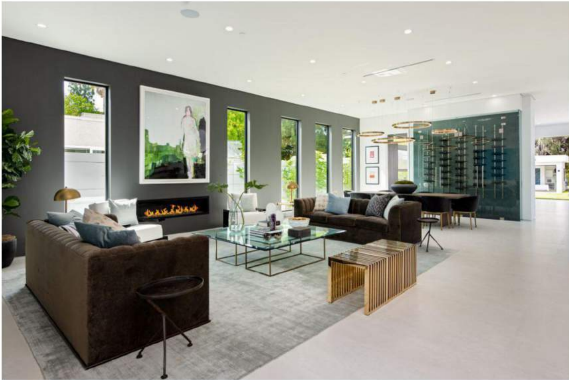
Greenleaf House in Sherman Oaks held the first cannabis open house in real estate history.