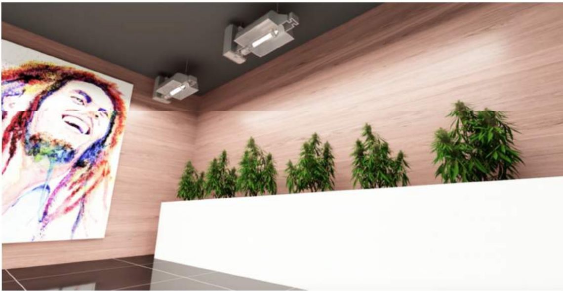
Screen grab animation of Huntington Estate Properties' future cannabis lounge estate, limited to six... [+]