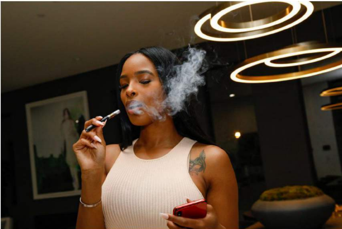
Cannabis infusion into residential real estate is expected to increase, fueled by millennials.