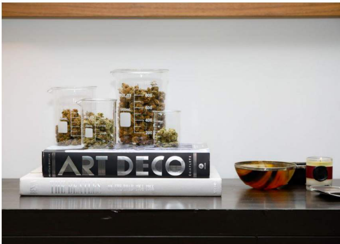
Cannabis is poised to shake up the real estate market.

Cannabis is poised to shake the real estate industry to its foundation. Virtually mainstream, it has effectively shed its stoner reputation. Millennials are receptive to it (and less offended by it) while Baby Boomers and Gen-Xers progressively appreciate cannabis' undeniable health benefits for their aches and pains. Cannabis is no longer an underground stoner binge, it's a booming cottage industry rebranded for wellness. In real estate, if you build it (with cannabis), they will come.