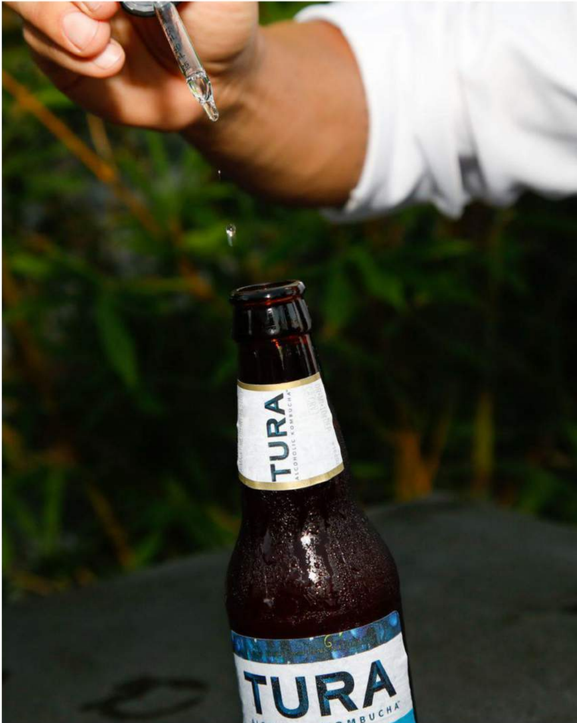
Tura Kombucha infused with CBD drops

Columbia Square Living produced a different cannabis experience in Hollywood—an elevated wellness rooftop pool party at the luxury rental tower, which has 200 renovated residences.