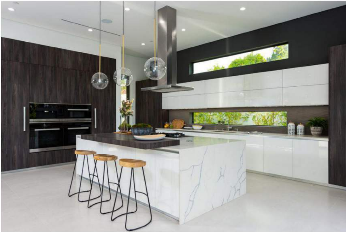
Greenleaf House, ground zero for the residential cannabis revolution.

In California, it's legal, publicly endorsed and unavoidable—no matter how nervous it makes corporate America, which should just mellow out, man (I don't do cannabis but I'm fluent in Cheech and Chong ).