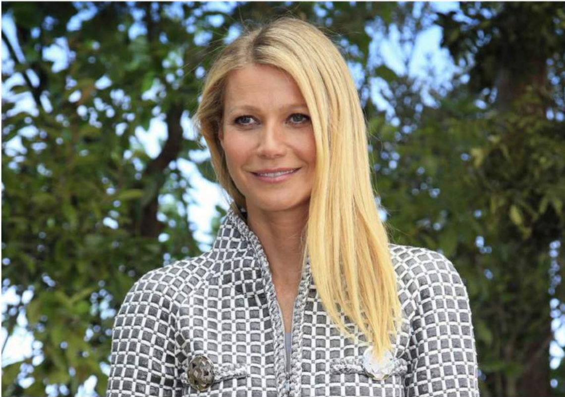
Gwyneth Paltrow's Goop lifestyle empire invests in wellness cannabis with products like vape pens,... [+]