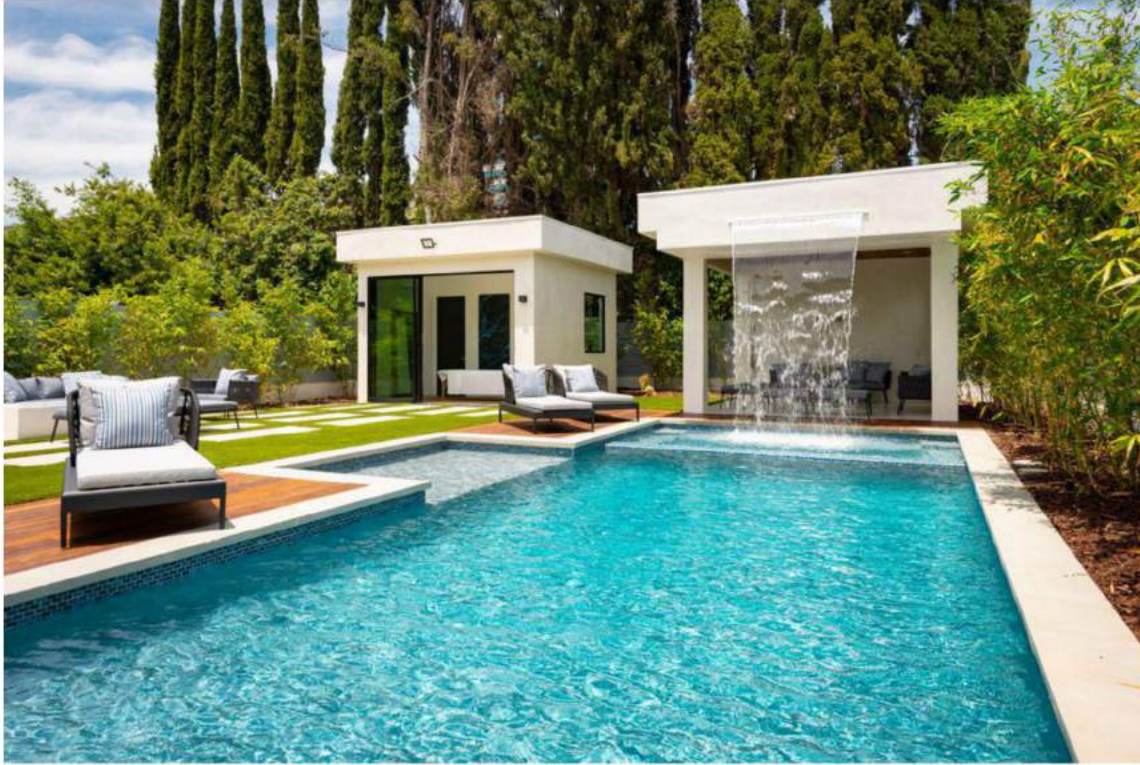
Backyard pool, spa, waterfall and 250-square-foot cabana at Greenleaf House.

Promoted as a “sensory experience challenging everything you know about cannabis and real estate,” it’s the first known cannabis open house in real estate history.