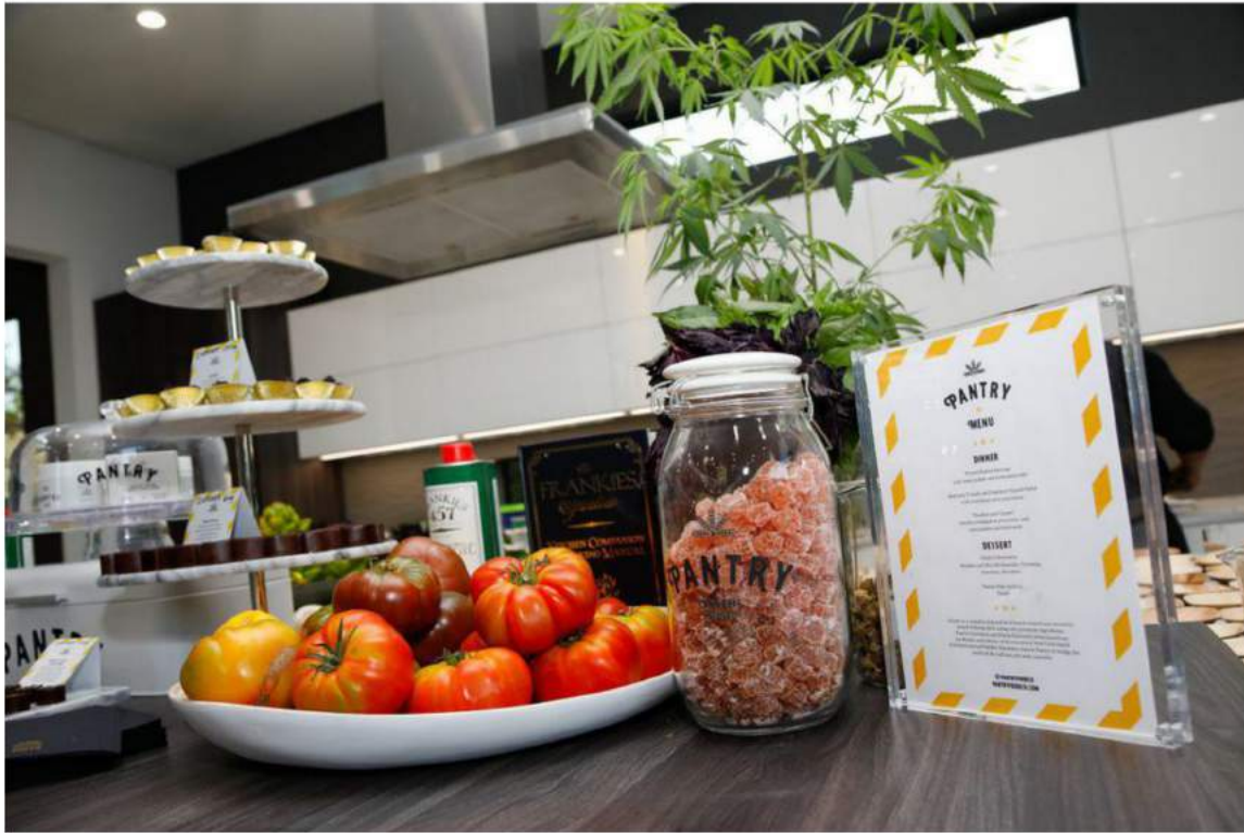
A variety of cannabis-infused edibles, including chocolates and gummies.

They sipped kombucha cocktails, snacked on cannabis-infused edibles, crafted cannabis bouquets, indulged cannabis beauty products, snacked, enjoyed CBD cream massages, snacked, savored a “cannabis cabana” harvest, and snacked some more.