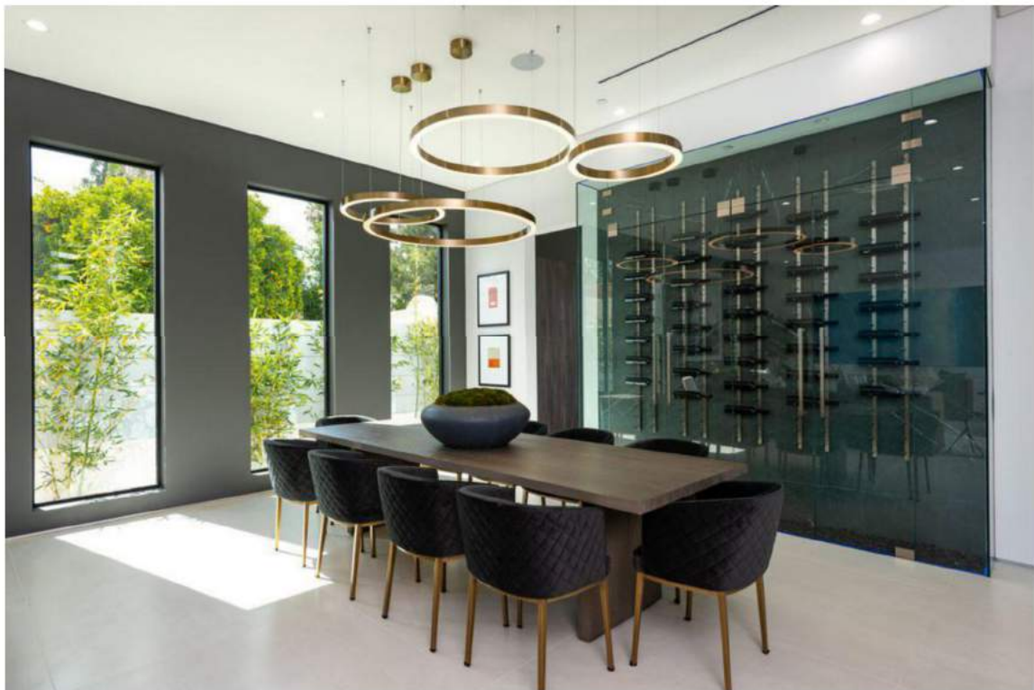
Elegant dining space