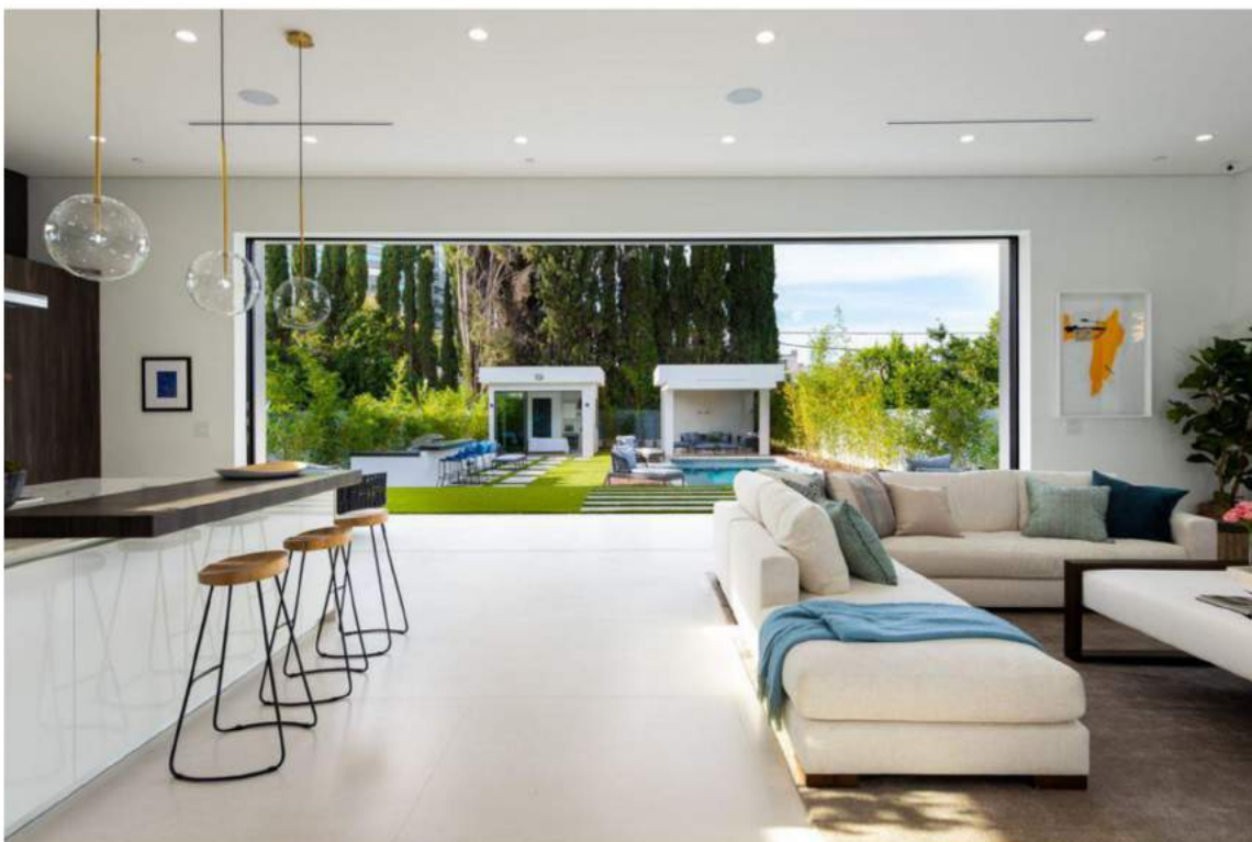
Greenleaf House offers an open-air ambiance and 5,600 square feet of living space NILS TIMM

Cannabis is still disruptive and controversial. But controversy can be mined into gold (this is the Golden State, after all). A brave few are blazing this new trail like early prospectors during the California Gold Rush.