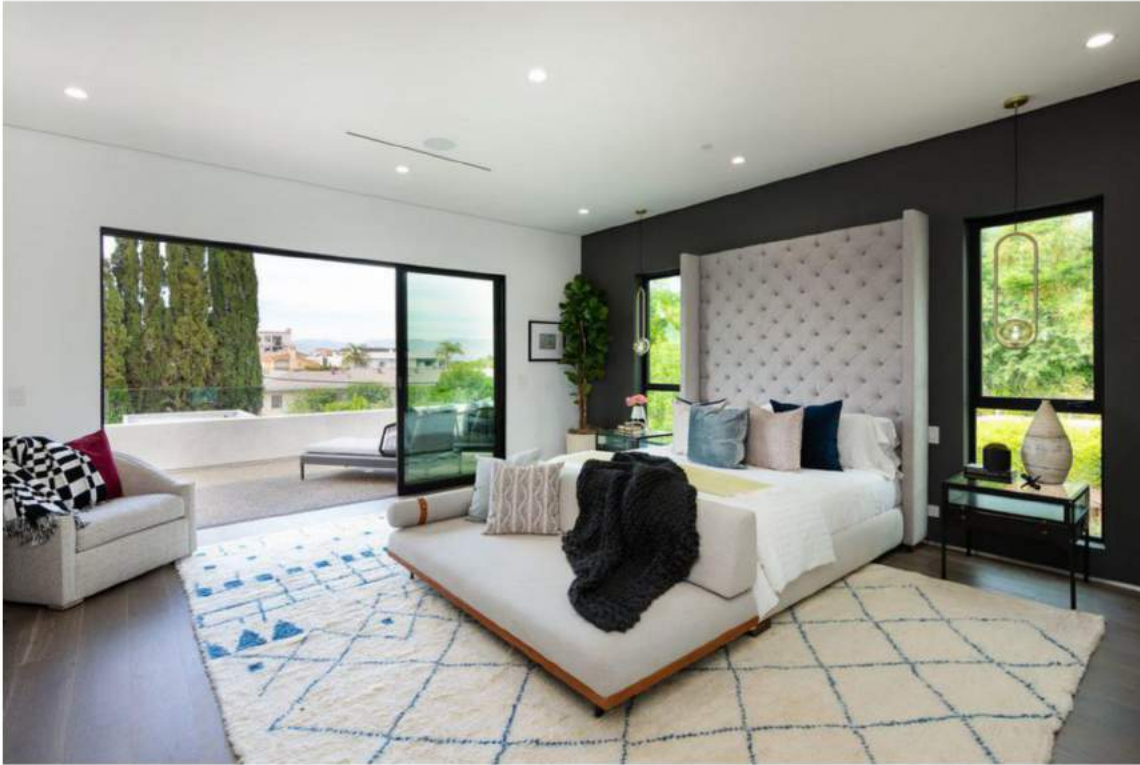
Greenleaf House features six bedrooms and seven-and-a-half bathrooms.

At Greenleaf House, a recent cannabis seminar trained 50 real estate agents how to harvest, cure and trim cannabis plants—preparing them for this changing market.