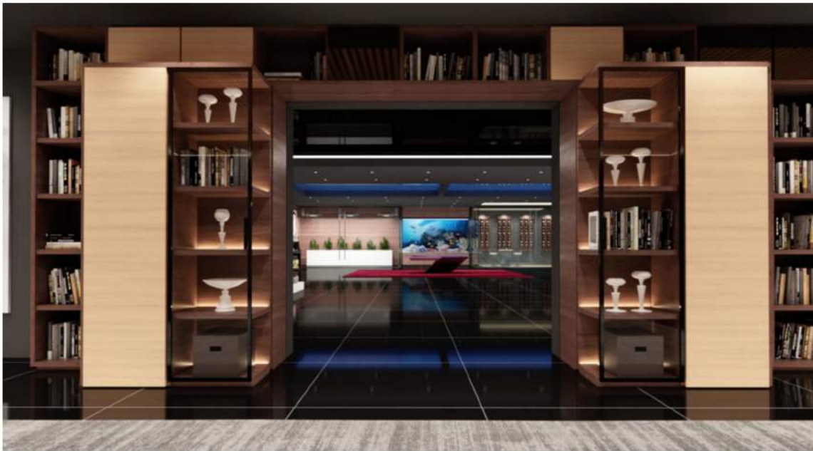
Screen grab animation of Huntington Estate Properties' speakeasy-style entertainment lounge hidden... [+]