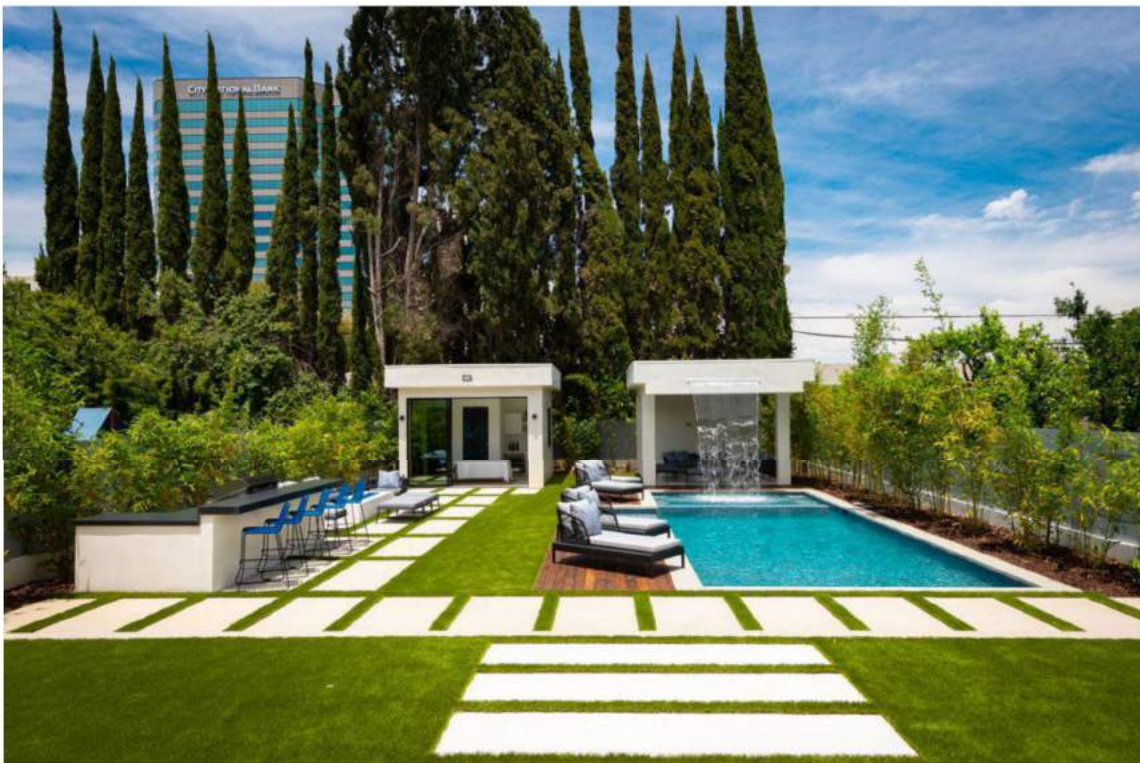
Greenleaf House backyard which hosted the cannabis cabana harvest. NILS TIMM

The Greenleaf House is a six-bedroom, seven-and-a-half bath turnkey residence with 5,600 square feet of living space, a home theater, waterfall pool, spa, outdoor bar, 200-square-foot guest suite, and 250-square-foot backyard cabana—an ideal setup for The Greenleaf Cannabis Laboratory Party .