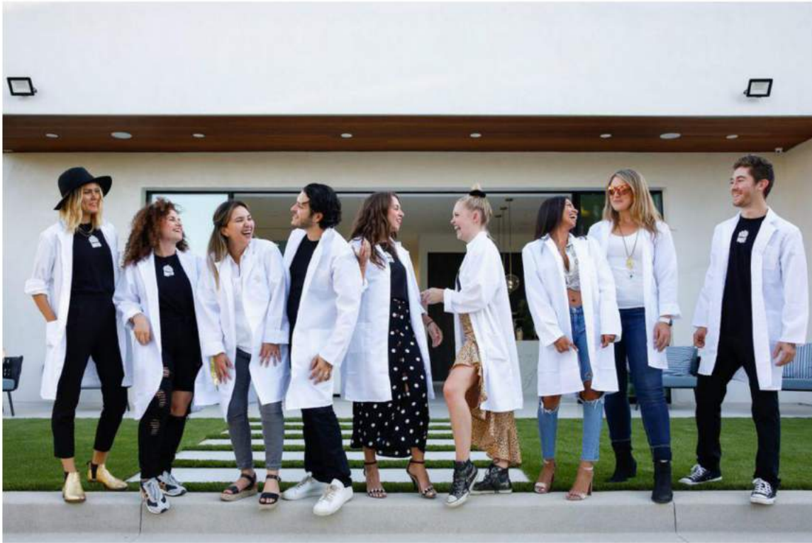
The Mota Group crew don lab coats in preparation for a "high-minded experience" and serious cannabis... [+]

Word (or smoke signals) spread quickly. People casually walked in off the street, including a passerby family on its way to a cannabis dispensary (“true serendipity,” Quibrera says). This time, it wasn’t stoner or slacker radar. They were actually in the market for a luxury home too.