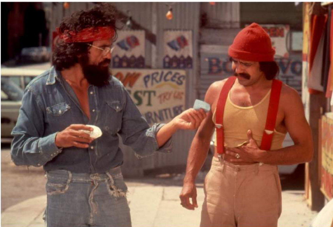
Renegade comedians Tommy Chong and Cheech Marin in the cult classic, 'Up In Smoke' in 1978.